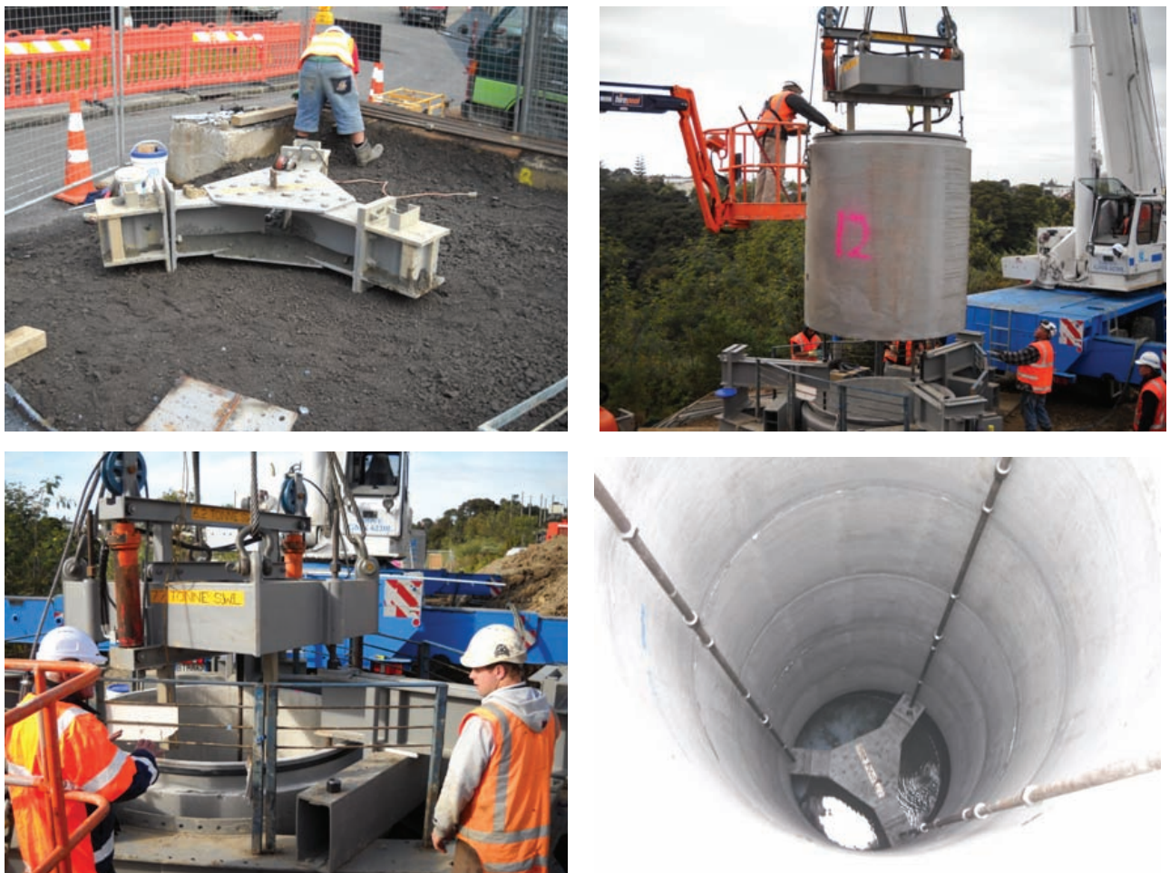
FIG 1 - Birkdale deep manhole.

The device for safely lowering the manhole units has been developed and refined between projects. Elements of the current configuration are shown in Figure 1 as used on the Birkdale project.