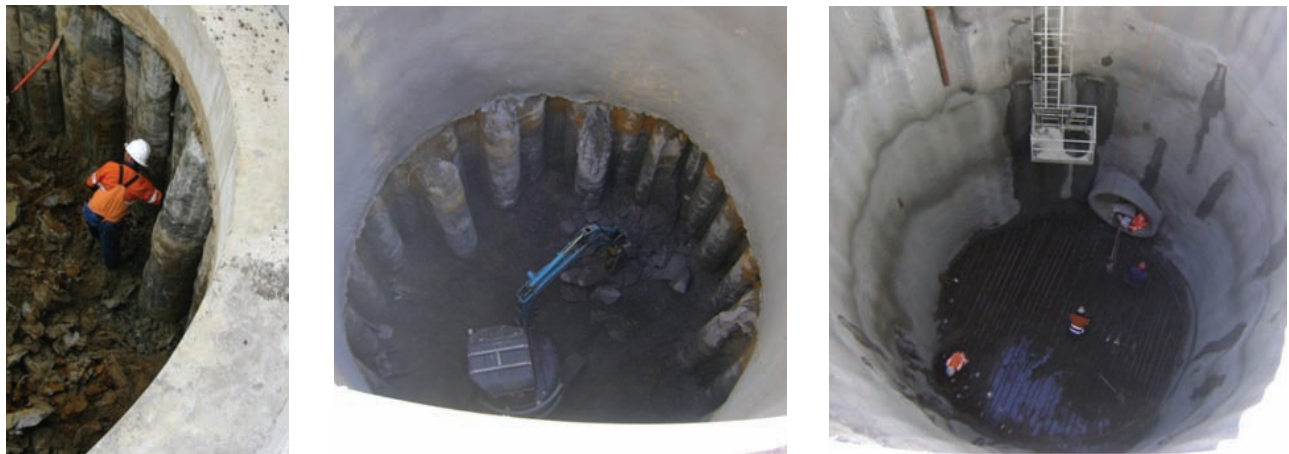
FIG 6 - Nikau street shaft.

with foundation piling the bore stability can be maintained with the use of either temporary casing or support fluids.