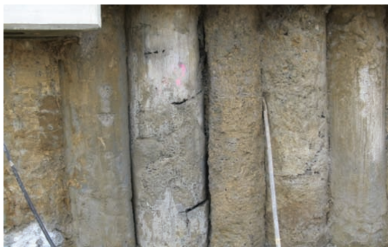
FIG 5 - Loss of pile integrity.

The second and third shafts were part of the Auckland City Council Nikau Street to Abbotts Way Stormwater Upgrade to provide access to the 1.95 m diameter tunnel. The shafts were 6 m and 8 m internal diameter extending down 14 m and 19 m, respectively. The tunnel and thus lower portion of the shaft was in ECBF with overburden comprising either alluvial (sands, silts) or volcanic (silts, gravel, lapilli) deposits. As a cost effective alternative to cased bored piles, given the unstable soils and thus the need for long temporary casings, continuous flight auger (CFA) piling was used to form the 600 mm diameter secant piles. The primary issue on the project was the poor tolerances achieved which meant that piles were misaligned and in some cases there was no overlap. The primary cause was the high strength of some of the low strength female piles; test samples later confirmed cylinder strengths of up to 17 MPa at seven days were present instead of 2 - 4 MPa. This highlights the need to clearly brief and engage with the concrete batch plant operator so that the unusual requirement to not exceed a maximum strength is understood. Less significant issues such as the pile layout, auger string stiffness and boring head also contributed to the misalignment but to a lesser degree.