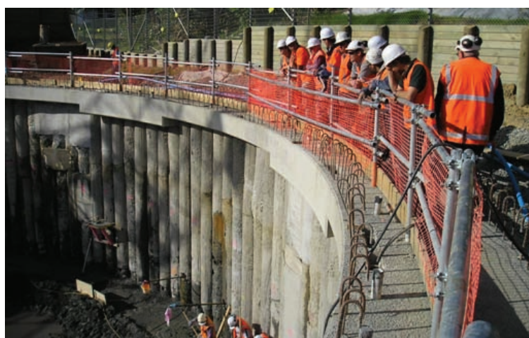
FIG 4 - Hobson shaft.

The first secant pile wall shaft was constructed to support the weak overburden at Pump Station 64, Hobson, Auckland; part of the Watercare Orakei Main Sewer Diversion Project. The 23 m internal diameter shaft extended to an overall depth of 36 m predominantly within the East Coast Bays Formation (ECBF) siltstones and sandstones. While this material could be safely excavated using bolts and mesh, the 6 m depth of overburden comprising of fill, recent alluvial deposits, tuff and ash was unstable with a high groundwater level. In addition, heavy plant serving the shaft/pump station construction was required adjacent to the excavation. A secant pile wall was used to support the 6 m deep overburden made up of 152 No 600 mm diameter cased bored piles (Figure 4). Whilst the wall and shaft were successfully constructed there were some key lessons learnt: